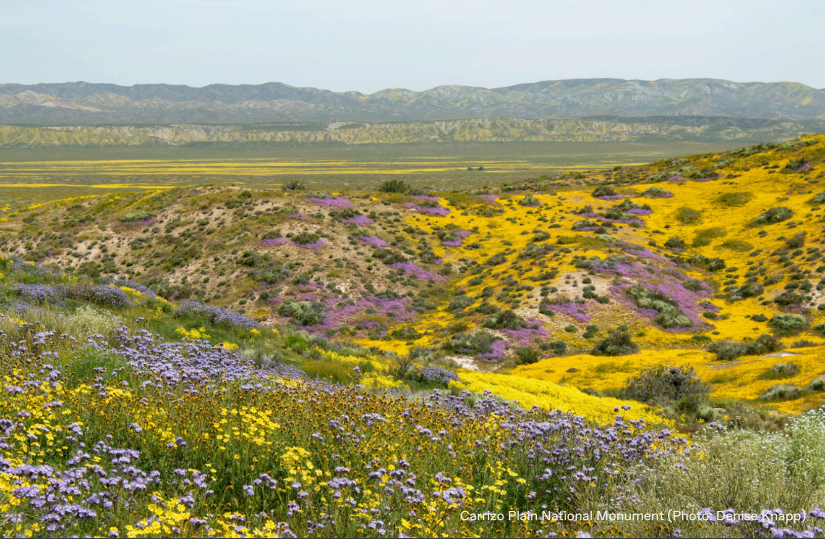
Carrizo Plain National Monument