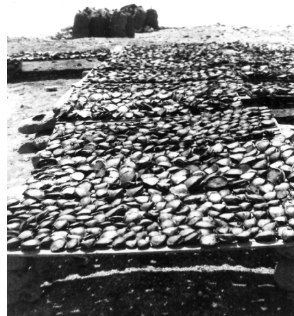
Figure 12. Abalone meat drying and abalone shells sacked for shipment to market.

In February 1913, the government granted Linton a lease giving him exclusive rights to 12½ miles of San Nicolas Island coastline, both below high tide line and for a specified distance shoreward,