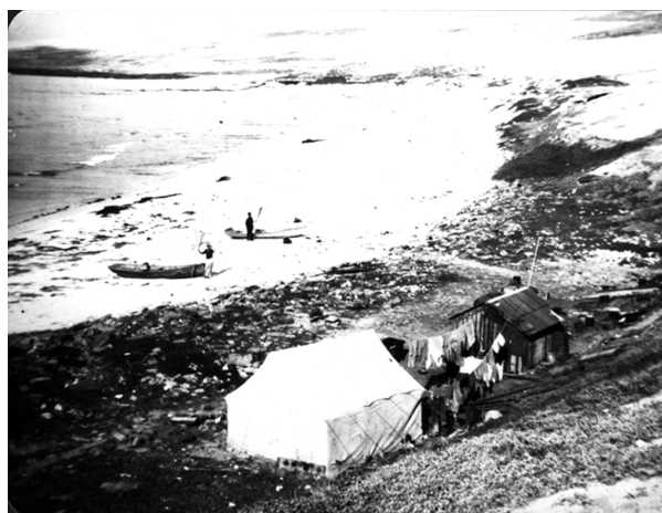
Figure 8. Linton established camps on several islands to support his commercial operations.

employed Japanese divers (Figs. 10–11) to plant the seeds for pearl growth in black abalone beds. His island employees also harvested abalone meat and shells (Fig. 12). By 1910, Linton had amassed enough pearls to open a jewelry store in Long Beach (Fig. 13). In September 1911 Linton purchased the 60-foot power-cruiser, Flyer (Fig. 14), to service his island interests ( Los Angeles Times , September 28, 1911). He was familiar with Flyer , as he had chartered the vessel at least twice in 1909 to take members of the Cooper Ornithological Club, of which he was a member, on birding expeditions to the Channel Islands ( Los Angeles Times , June 26, 1909 and July 8, 1909).