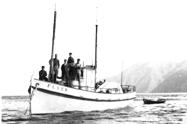
Figure 14. Linton purchased the 60-foot launch Flyer in September 1911 to service his island abalone harvest and mariculture interests.

Clarence Brockman Linton was a Channel Islands entrepreneur, who between 1907 and 1910