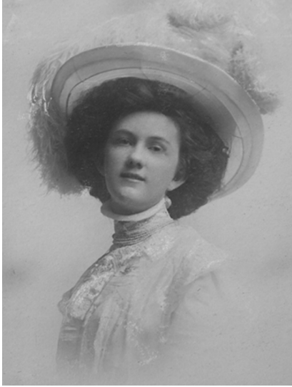
Figure 2. Lillian T. McClelland (1888–1977).

the chagrin of Clarence Linton, who salvaged the bird's severed head for his collection (Peters 1938; Fig. 7). This is the first and only known specimen record of this species from any of the California Channel Islands.