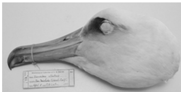
Figure 7. Laysan albatross head (MCZ 316509) salvaged by Linton from a specimen which had been killed and cooked for supper by the Mexican 'camp cook' at San Nicolas Island on April 5, 1910.

Three land bird endemics found on San Clemente Island may have been impacted as a result of Linton's collecting. Between 1907 and 1908, Linton collected 35 Bewick's wrens ( Thryomanes bewickii leucophrys ), 94 song sparrows ( Melospiza melodia clementae ), and 71 spotted towhees ( Pipilo maculatus clementae ) from San Clemente Island.