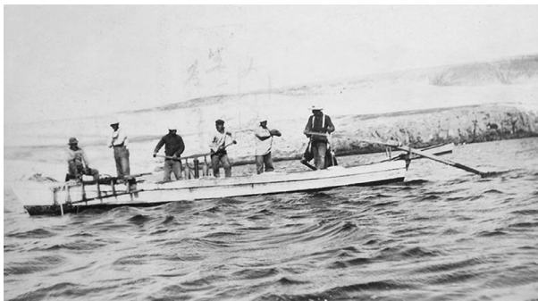
Figure 10. Linton's Japanese abalone divers.

Upon Flyer's return, Linton traveled to Washington, D.C. in July 1912 and met with officials from the U.S. Bureau of Fisheries to discuss the possibilities of establishing a preserve on one or more of the islands for "the study and advancement of the pearl-growing industry which