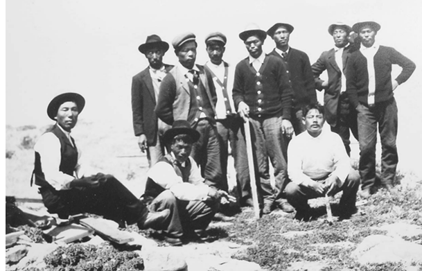
Figure 11. Linton's Japanese abalone harvesters.

has made considerable progress under private experiments" ( Los Angeles Times , July 18, 1912). As commercial abalone harvesting continued, Linton's frustrations grew: