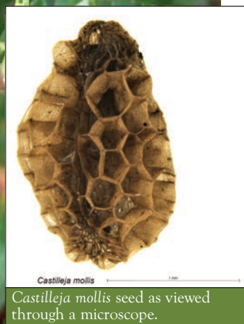
Castilleja mollis Castilleja mollis seed as viewed through a microscope.

Rare subspecies of Dudleya protected! Our biodiversity team completed status assessments and collected tissue samples to inform recovery efforts.