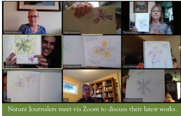
Nature Journalers meet via Zoom to discuss their latest works.