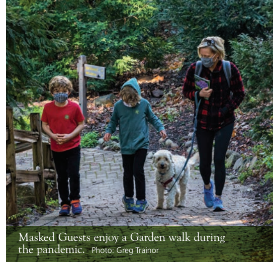
Masked Guests enjoy a Garden walk during the pandemic.