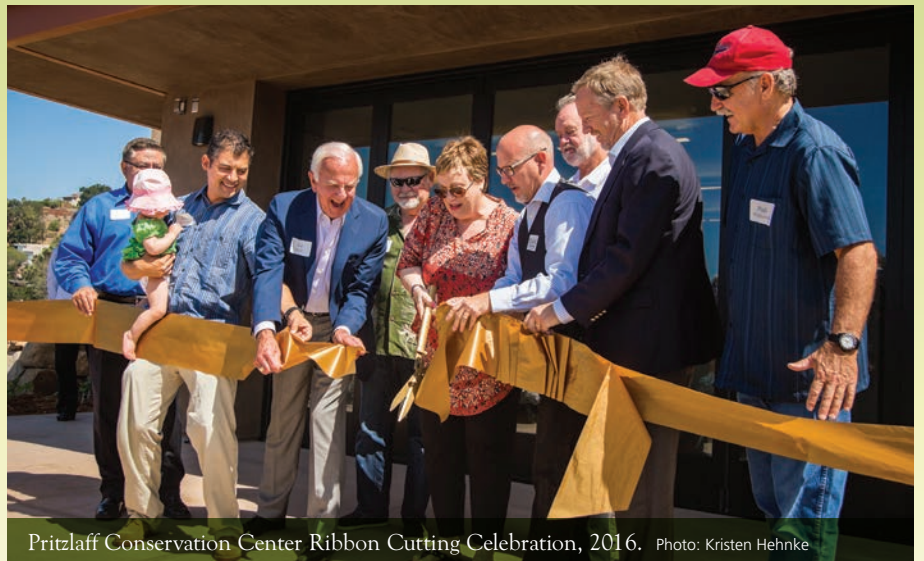
Pritzlaff Conservation Center Ribbon Cutting Celebration, 2016.