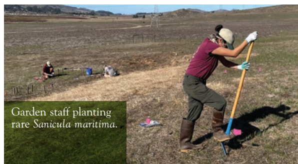
Garden staff planting rare Sanicula maritima .