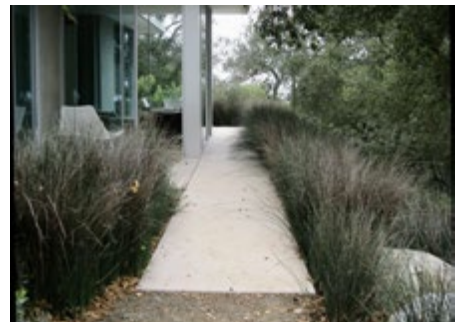
California Grey Rush ( Juncus patens )

Cultural conditions: Full sun to shade. Summer dormant but stays green with occasional water. Any soil. Vigorous even with modest water and will spread unless contained.