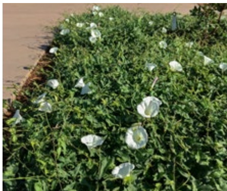
Anacapa Morning Glory ( Calystegia 'Anacapa Pink')

Description: Vigorous, twining vine with long, thin stems that climb with support to 20 ft. Bright green leaves topped by 3-inch-wide, funnel-shaped, white flushed with pink flowers over a very long season. Fast growing.