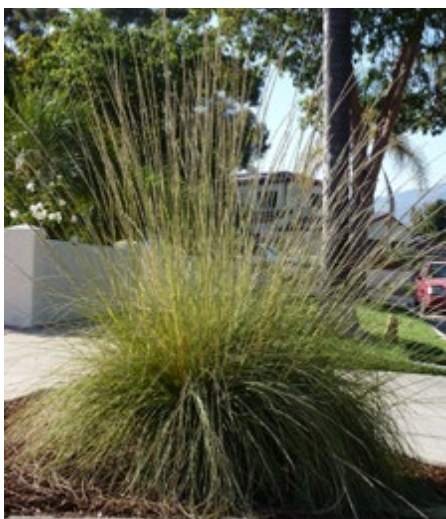
Deer Grass ( Muhlenbergia rigens )

Cultural conditions: Extremely easy grass that tolerates most soils and requires little watering. Bluest color in full sun. Cut to ground in fall when plants need rejuvenating.