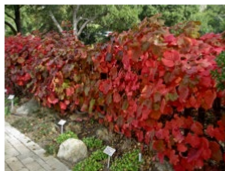
California Wild Grape ( Vitis californica )

Cultural conditions: Full sun to shade. Adapts easily to gardens and occasional irrigation. Heavy, saturated soil OK. Needs summer water to maintain vigorous growth.