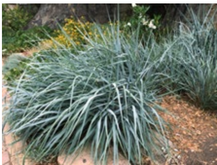
Canyon Prince Giant Wild Rye ( Elymus 'Canyon Prince')

Description: Larger, evergreen grass with stunning, icy-blue foliage and tall, bold flowers. Forms an attractive rounded clump that rarely exceeds 5 ft in flower. Reaches full height quickly then spreads at moderate rate by runners.