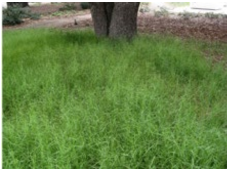
Thin Bentgrass ( Agrostis pallens )

Description: Bright green, perennial grass to 1 ft tall that spreads slowly into indefinite colonies. Goes somewhat dormant in mid-summer.