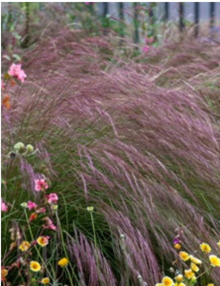
Purple Three-awn ( Aristida purpurea )

Cultural conditions: Full sun to shade. More drought tough in full shade. In full sun it requires occasional to moderate summer water to stay green. Any soil.