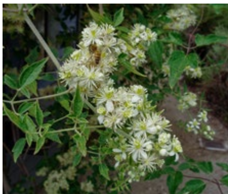
Virgin's Bower ( Clematis ligusticifolia )

Cultural conditions: Full sun to part shade, tolerant of any soil. Dies back to ground in summer heat; moderate water keeps it green and growing. Occasional deer browse.