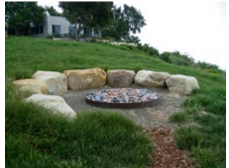
Clustered Field Sedge ( Carex praegracilis )

Cultural conditions: Full sun along coast to part shade inland. Moderate to occasional water, more in full sun. Tolerates heavy soils.