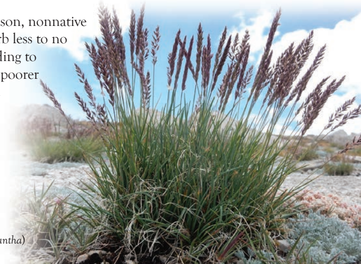
June Grass ( Koeleria macrantha )

By comparison, nonnative lawns absorb less to no runoff, leading to floods and poorer quality soil.